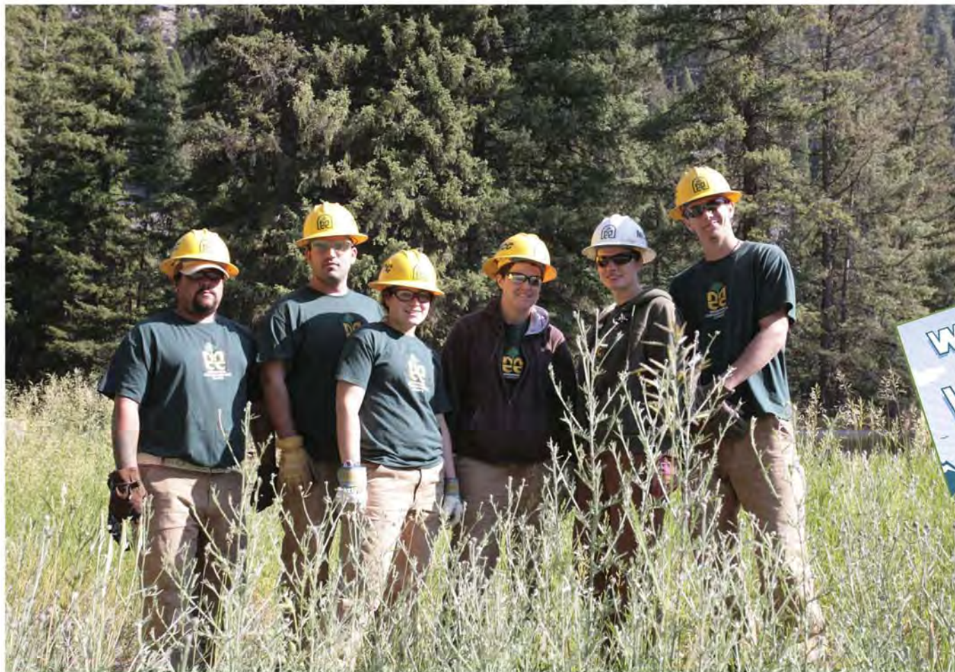
Youth volunteers inventory and hand pull 47 bags of spotted knapweed at Greek Creek Campround.