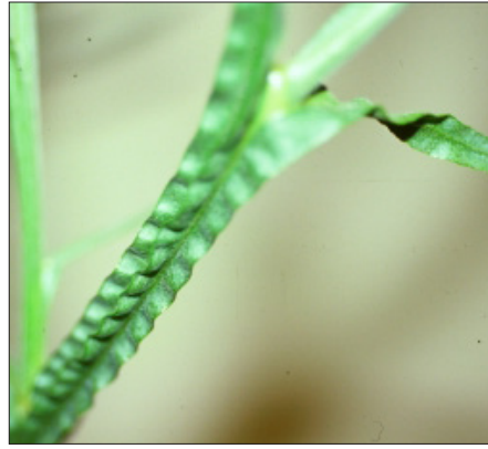
FIGURE 3. Flattened or winged stems.