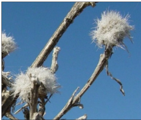
FIGURE 5. Cottony tufts remaining after seed dispersal.