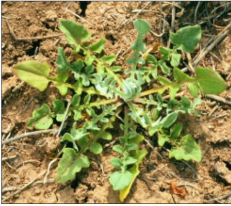
FIGURE 2. Rosette of yellow starthistle.