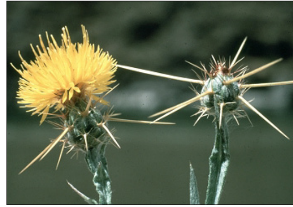
FIGURE 4. Yellow flowers with long spines ( \frac{3}{4} to 1 inch) on the receptacles.

Plumeless seeds are retained in the seed head longer, sometimes remaining through winter or until the plant decays. They typically fall immediately below the parent plant and comprise only 10 to 25 percent of the total number of seeds.